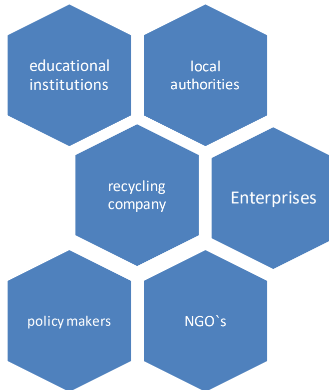
Fig 1. Profile of WamPPP Network Memebrs

Both public and private sectors are active in management of solid waste in developing countries. There is an emerging trend in encouraging the private sector to enter into solid waste management (SWM) operations, and attempts are being made to formally link the public and private sector operators. Such linkages may improve the efficiency of the entire sector and create new opportunities for employment. However, any change in the present order may inevitably affect the lives of millions of most vulnerable and marginalised population in the cities of the developing counties—both as users and providers of the service. It is worth revisiting the fundamentals of partnerships from the perspective of relevant theories.